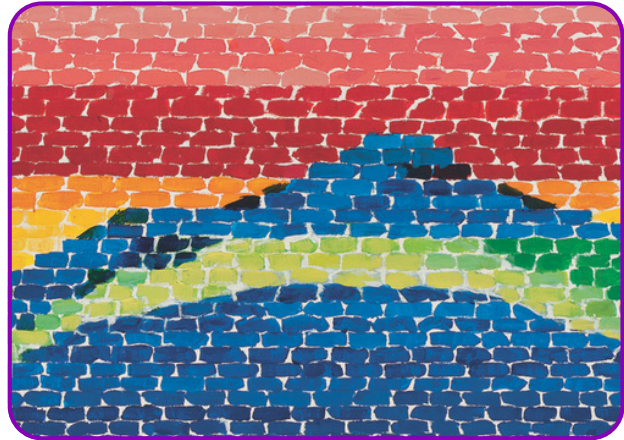
Apollo 12 Splashdown - 1970

Thomas was inspired by nature, music, and the world around her. She often spoke of translating the beauty of gardens, sunlight, and space into color. Her signature “mosaic-style” brushstrokes resemble tiny tiles or “color stripes,” which she used to express harmony and joy. Her work is a bridge between realism and abstraction, showing how color itself can convey emotion and movement.